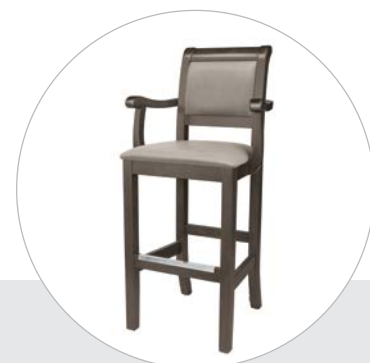
The Freeport is also available with arms