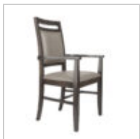
Alta Arm Chair