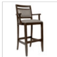
Alta Barstool with Arms