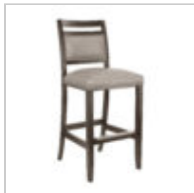
Alta Barstool with Accent Seat