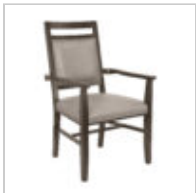
Alta Arm Chair with Accent Seat