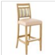
Alta Barstool with Accent Seat