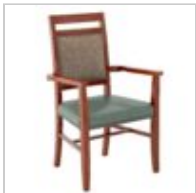
Alta Armchair with Accent Seat