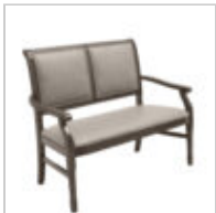
Ambassador Bench II