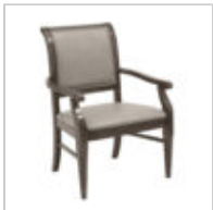
Ambassador Bariatric Arm Chair