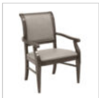
Ambassador Bariatric Arm Chair