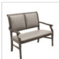
Ambassador Bench II