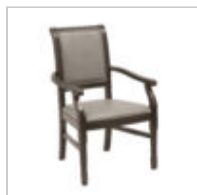
Ambassador Arm Chair II