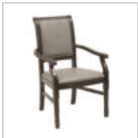
Ambassador Arm Chair II