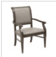
Ambassador Bariatric Arm Chair