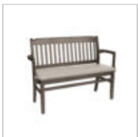
Bulldog Arm Bench