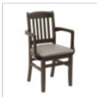
Bulldog Arm Chair