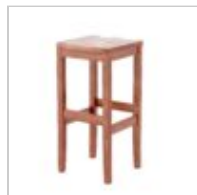
Bulldog Backless Barstool