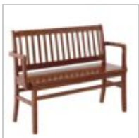
Bulldog Arm Bench