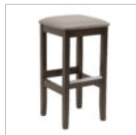
Bulldog Backless Barstool