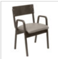
Custom Carlo Arm Chair