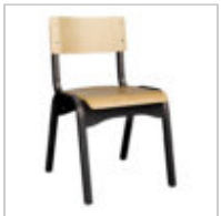
Carlo Chair Standard