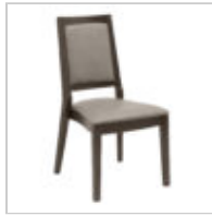
Dallas Stacking Side Chair