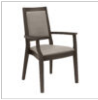
Dallas Stacking Arm Chair