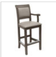
Freeport Parlor Barstool