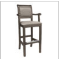
Freeport Arm Barstool