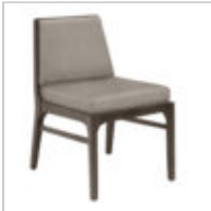
Lucca Side Chair