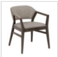
Malmo Arm Chair